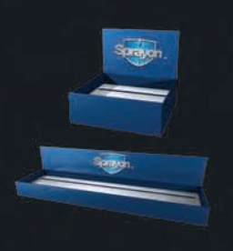
SPRAYON® SYSTEM MAGNETIC CAN HOLDERS