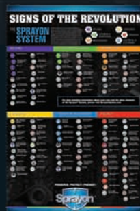
SPRAYON® SYSTEM EDUCATIONAL POSTERS