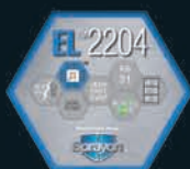
SPRAYON® SYSTEM PRODUCT ID TAGS