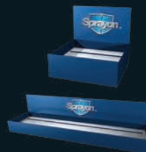
SPRAYON® SYSTEM MAGNETIC CAN HOLDERS